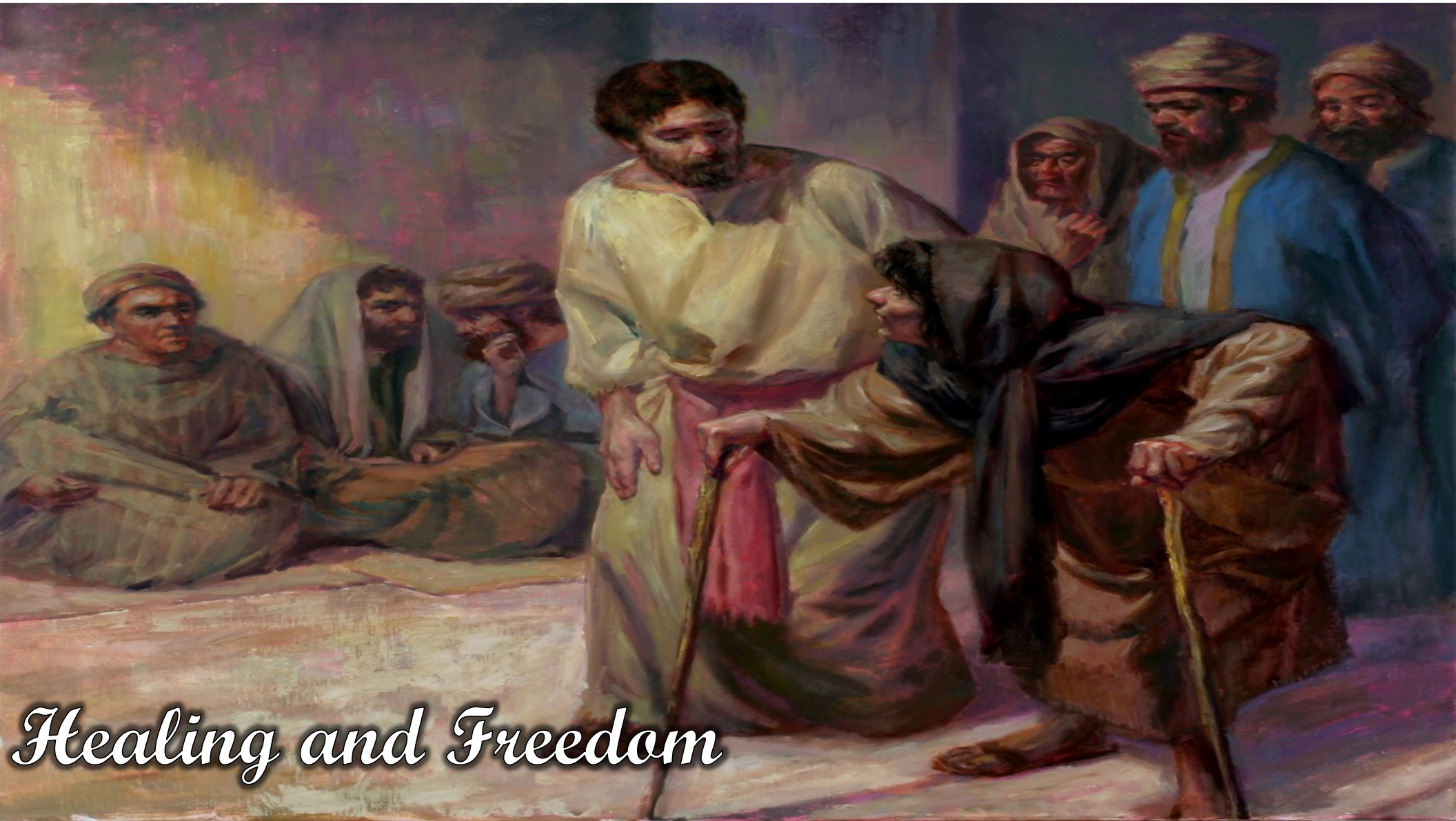
Healing and Freedom