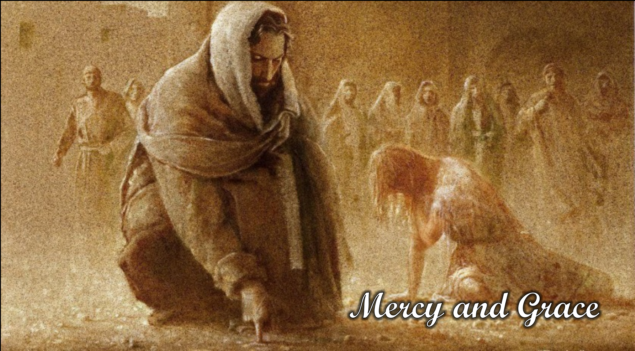
Mercy and Grace