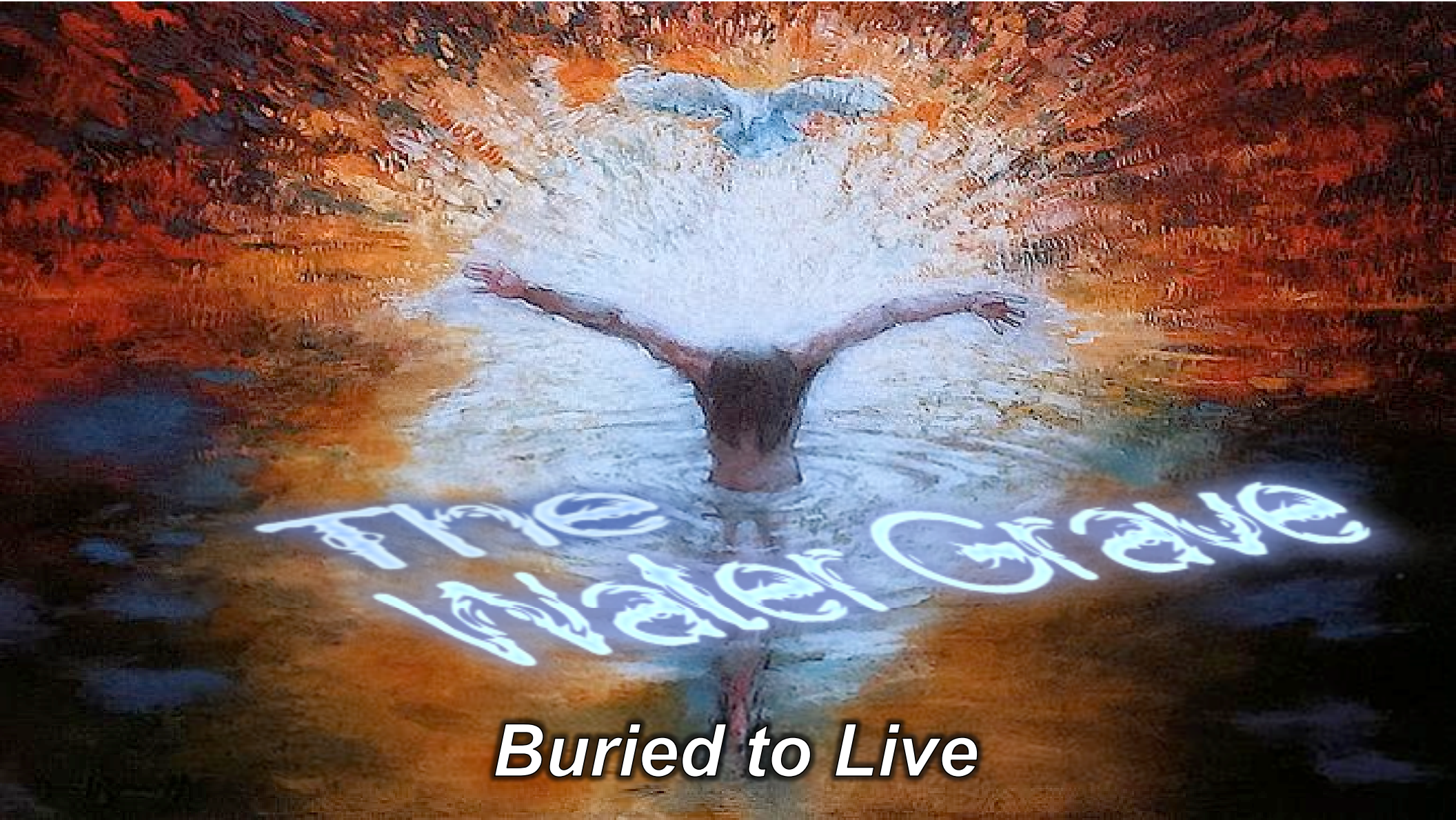
Buried to Live